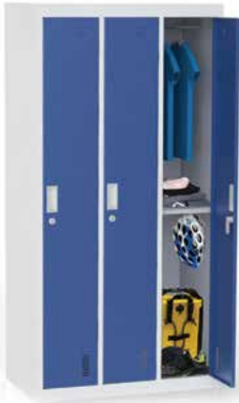
BCL01 1 Door Locker Unit