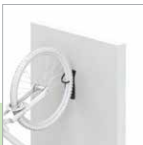
Domestic Racks & Repair Stations