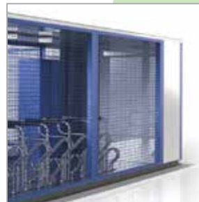
Lockers, Shelters & End-of-Journey Facilities