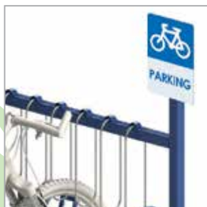
Directional & Safety Signage