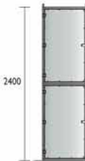
Front View Stackable

Hasp and staple for cyclists to provide their own padlock.