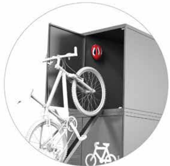
2 Storey Arrangement showing pull-out wheel guide