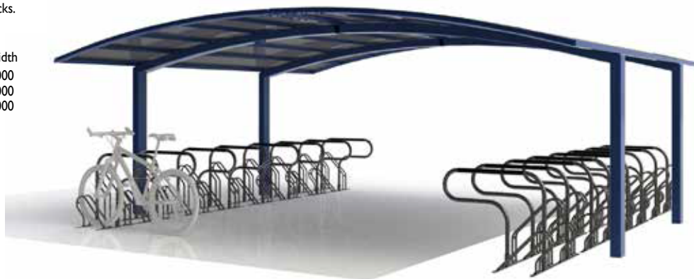
Front View 5100